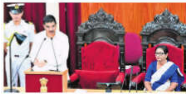
Hari Babu Kamhampati, Odisha Governor

The Governor's speech highlighted the steps taken by the govern-