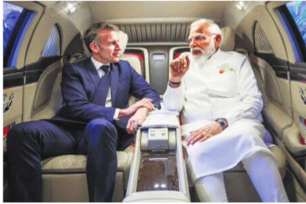
PM Narendra Modi with French President Emmanuel Macron during a car ride, in Mumbai