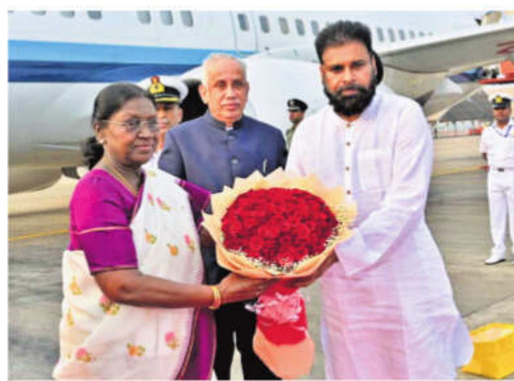
President Droupadi Murmu being received by Governor S Abdul Nazeer and Deputy Chief Minister Pawan Kalyan at INS Dega in Visakhapatnam on Tuesday

At sea, participating warships carried out coordinated formation manoeuvres as part of preparations for the Fleet Review scheduled for February 18. Among the prominent vessels were INS Vikrant, India's first indigenously built aircraft carrier, and the sail training