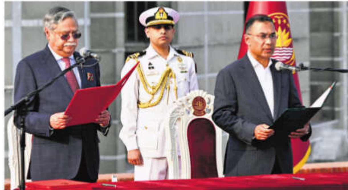
Tarique Rahman, Chairperson of the Bangladesh Nationalist Party, takes oath as Prime Minister of Bangladesh at the National Parliament complex in Dhaka, Bangladesh